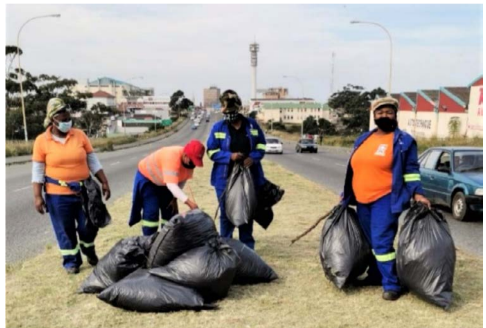
Hard working staff at BCM undertaking grass cutting. Pictured below is the clearing up of illegal dump sites. BCM urges the public to please refrain from dumping and use the service sites provided.