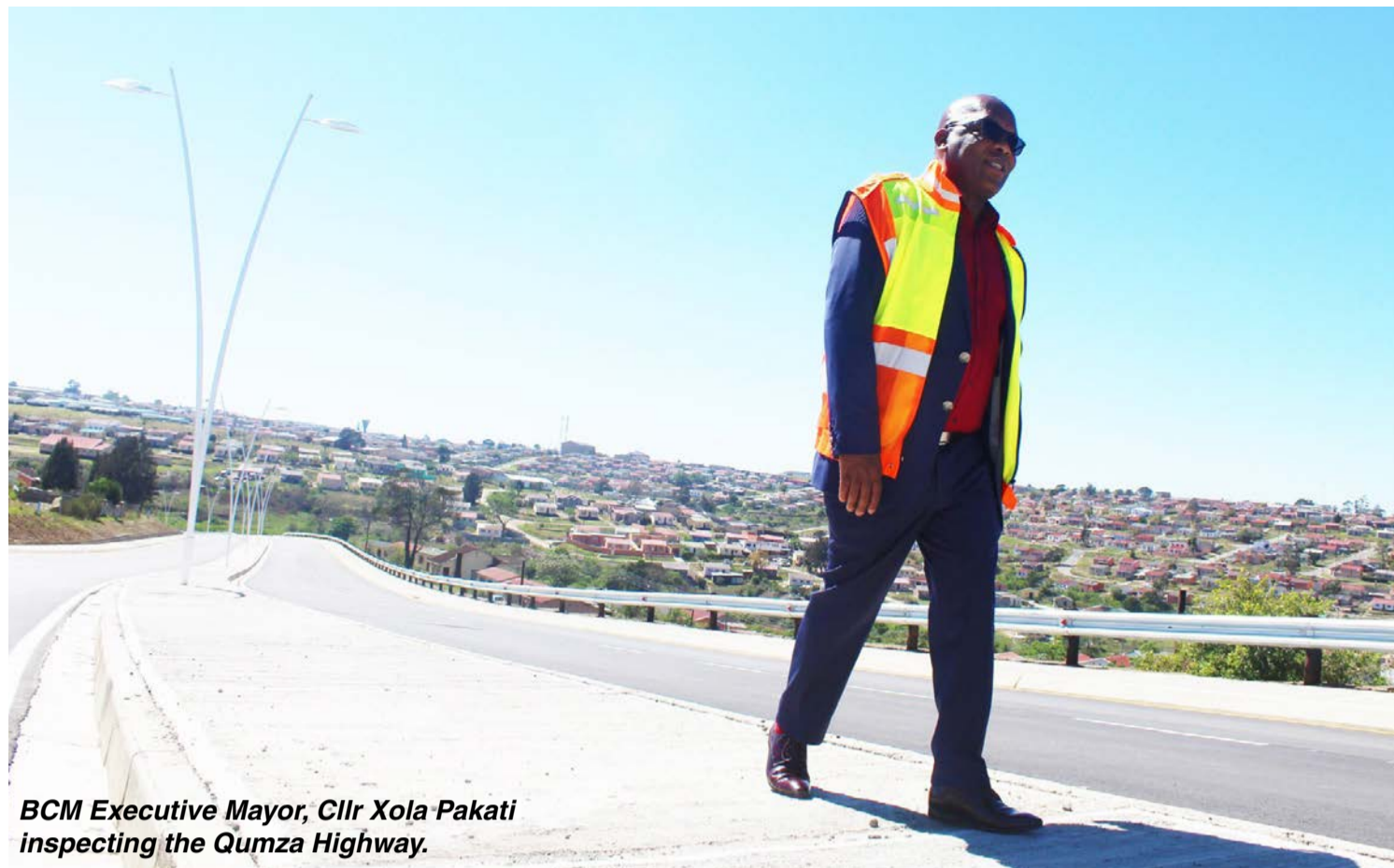
BCM Executive Mayor, Cllr Xola Pakati inspecting the Qumza Highway.