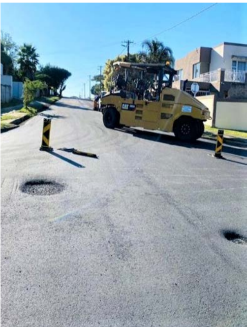
Pictured is the ongoing rehabilitation and resurfacing of roads in the Buffalo City Metro.